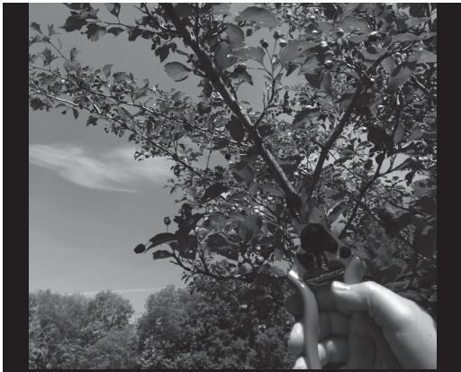
Pruning young trees utilizes simple equipment such as hand pruners, pole saws, and hand saws.